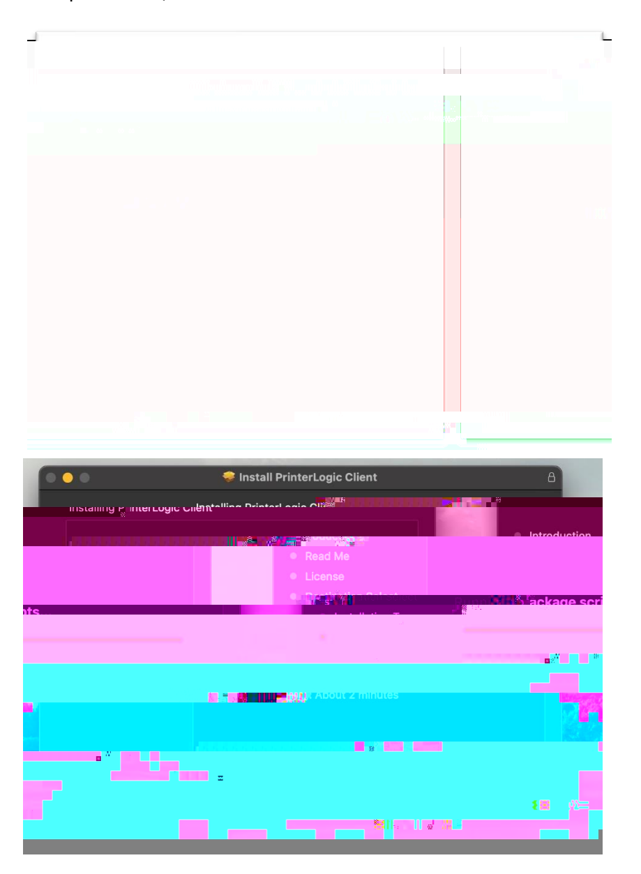
Step 4: Once your download is completed double click it to begin the client installation. You can click continue through the whole installation. (Note you will be asked to put in your Mac password)