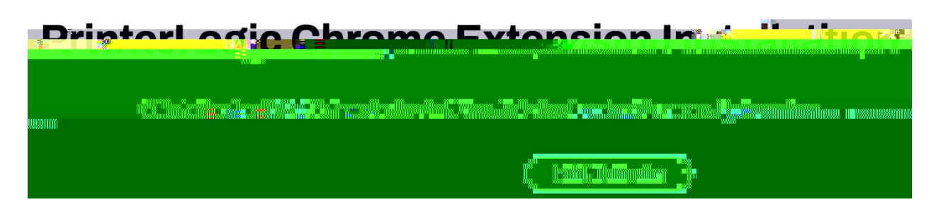
Step 2: You will be prompted to add the extension to chrome